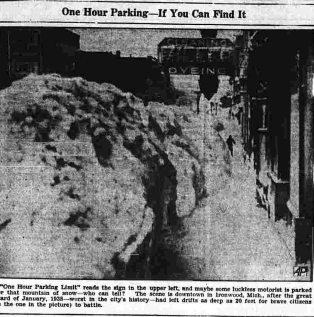
"One Hour Parking Limit" reads the sign in the upper left, and maybe some luckless motorist is parked under that mountain of snow—who can tell? The scene is downtown in Ironwood, Mich. after the park blizzard of January, 1938—worst in the city's history—had left debris as deep as 20 feet for brave citizens (like the one in the picture) to battle.

Washington, Jan. 28.—(AP)—The text of President Roosevelt's message on National defense follows: "The Congress knows that for many years this government has national security and requires increase for that reason."