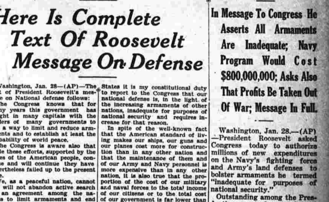
Mr. Roosevelt today authorized Congress to authorize millions of new expenditures on the Navy's fighting force and Army's land defenses to bolster armaments he termed "inadequate for purposes of national security."